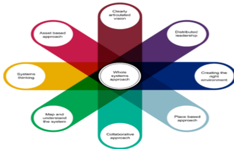
Figure 2: A whole system approach

Local Authorities are key leaders in any place-based actions as they are already acting on Marmot's key policy objectives: